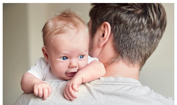
Manual and summary table