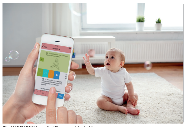
The VADEMECUM app for iPhone and Android

The principle always applies: As parents you should not feel alone when you are concerned about the child's development.